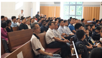
BOYS' BRIGADE 50 TH ANNIVERSARY by Samuel Chong