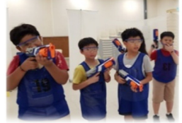
3 Evangelism Tools